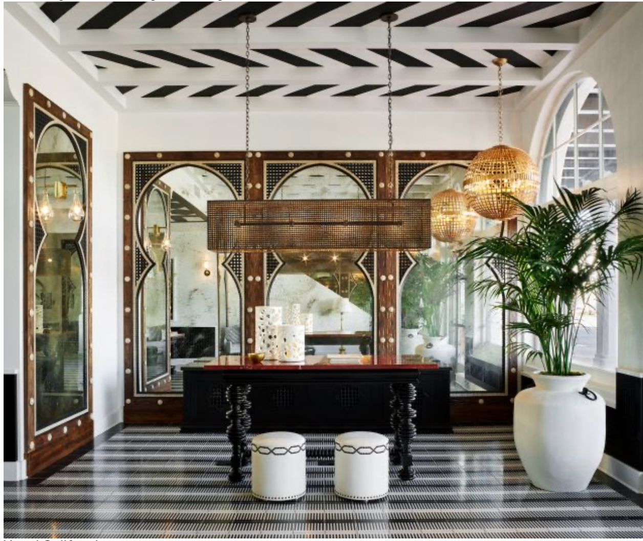
Hotel Californian. HotelCalifornian

During a recent stay at the property, my room featured a portrait of Marilyn Monroe with tattoos, while an ink-covered Audrey Hepburn is another option. Many of the bright, airy rooms open up onto balconies, which make for the perfect place to enjoy your morning room service breakfast. The sophisticated rooms are outfitted with lush velvet furniture, glamorous golden snake sconces and custom Martyn Lawrence Bullard finishes. Each night, you'll experience an elevated version of turn down service, with a special poem or note left for you next to your cozy bed.