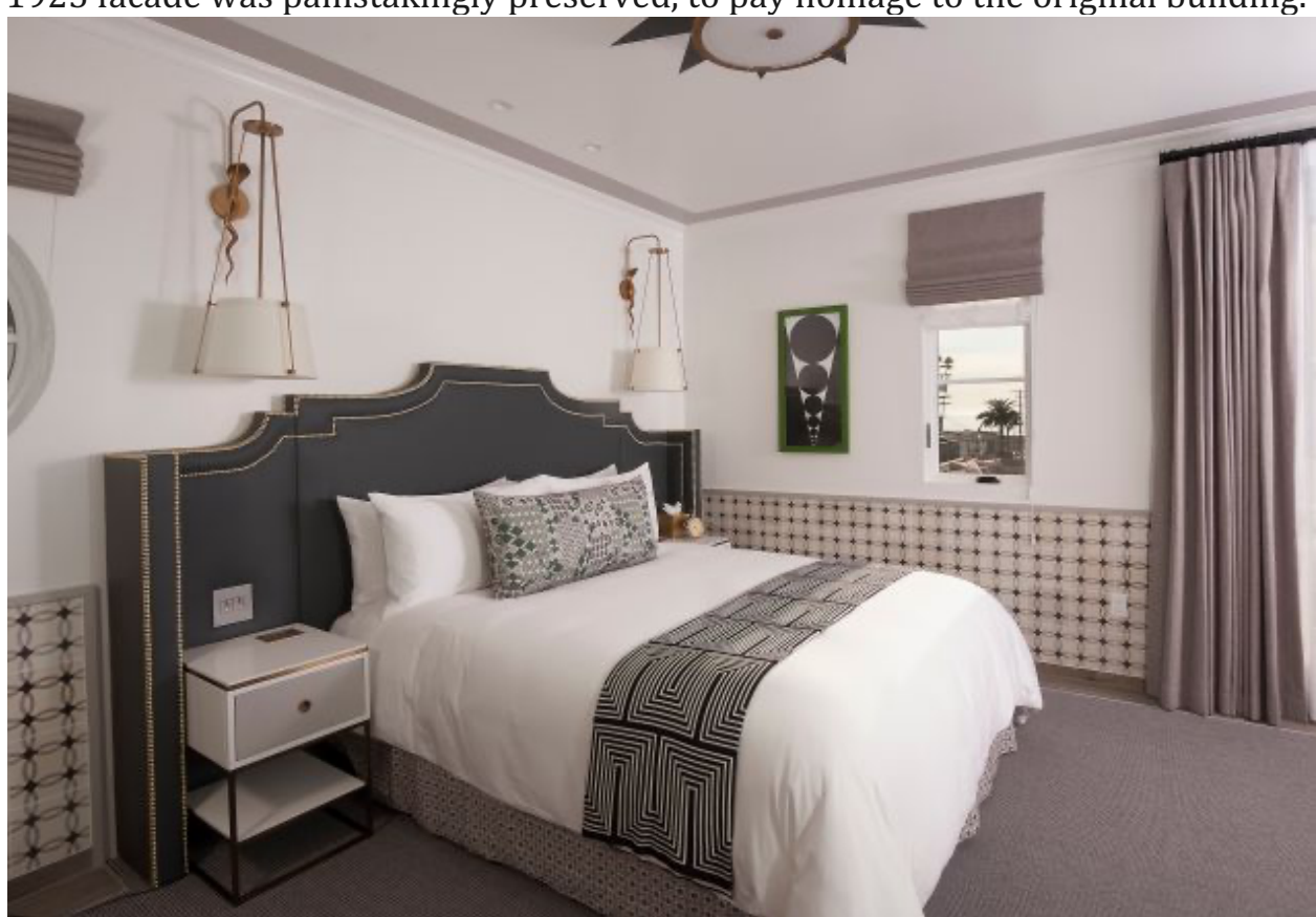
A room at the Hotel Californian, Hotel Californian

In 2012, the hotel was completely demolished, and work began to bring it back to its former glory. The newly built property, now a member of <u>Preferred Hotels</u>, officially opened its doors in 2017. While the hotel has been entirely redone, the 1925 facade was painstakingly preserved, to pay homage to the original building.