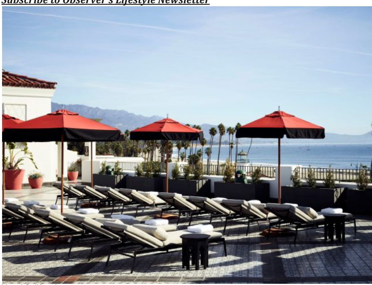
Hotel Californian. Visit Santa Barbara

Subscribe to Observer's Lifestyle Newsletter