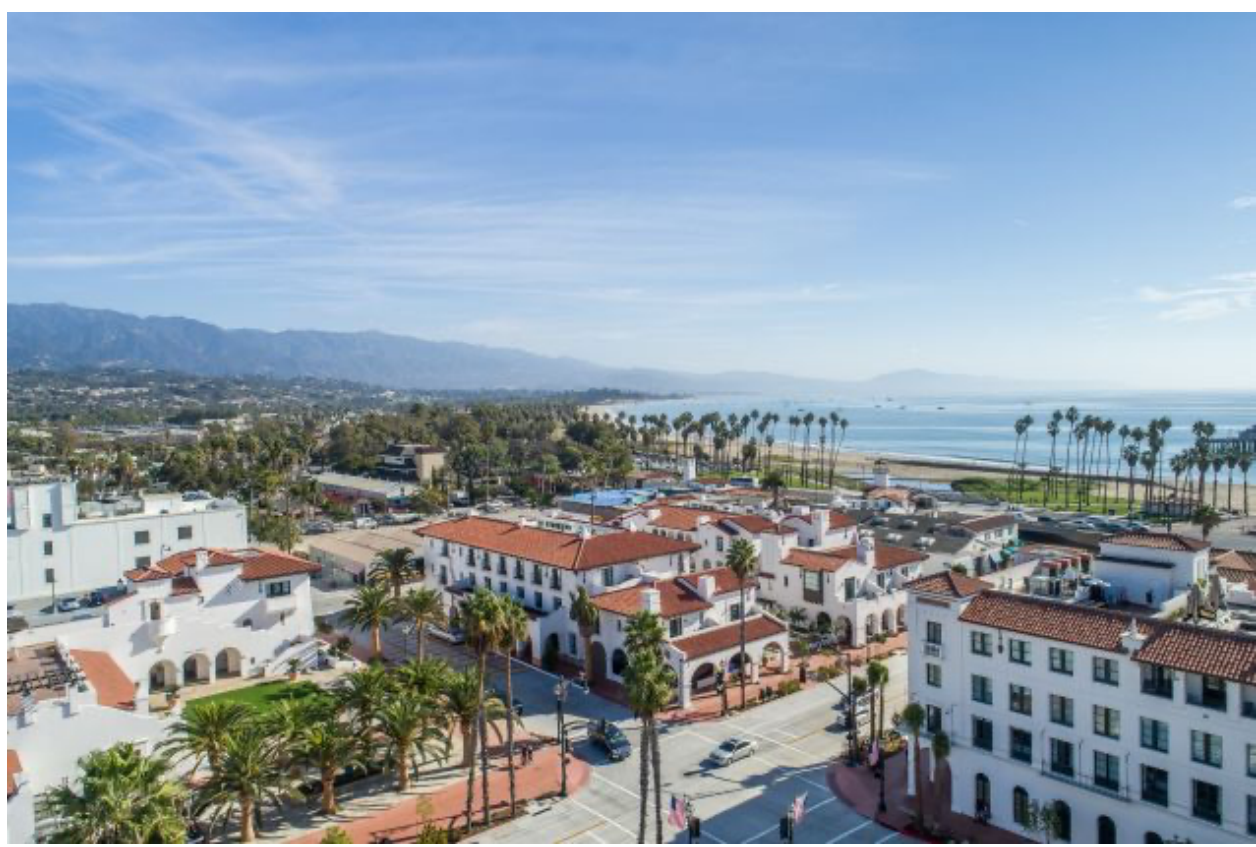
Santa Barbara