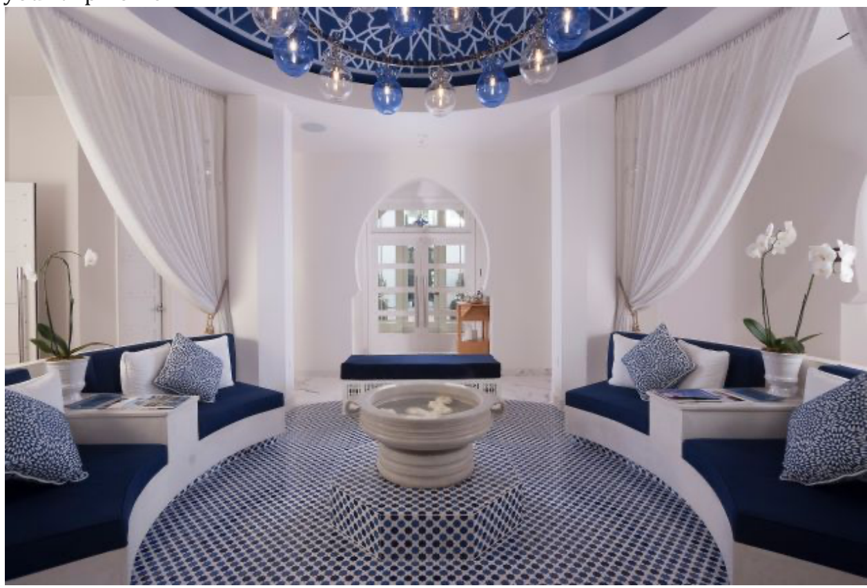
Majorelle. Hotel Californian