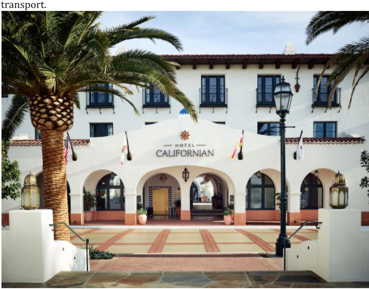
The Hotel Californian, Hotel Californian

If you're in Los Angeles, it's only about a two hour drive, making it a super convenient option for a long weekend away. It's also a relatively painless ride from LAX, especially if you rent a car for the weekend (although many places are walkable in the Funk Zone). For another transportation alternative, The Pacific Surfliner Amtrak train arrives directly at the hotel, and provides coastal views throughout your journey. Santa Barbara also has its own airport, with nonstop flights from cities including San Francisco, L.A., Dallas and Denver, though anyone arriving from the East Coast will need to either take a connecting flight or fly into a major SoCal airport, and then take one of the aforementioned modes of